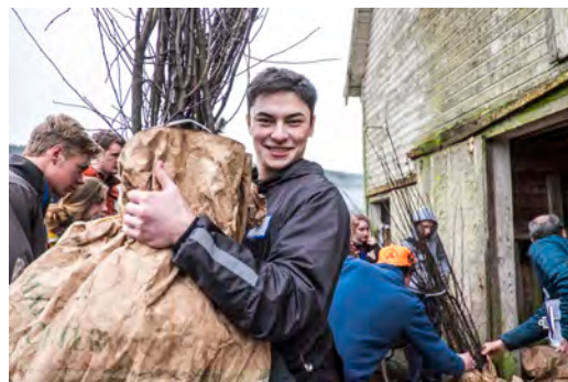
Youth Crew Leader – NWI's Plant-A-Thon 2015