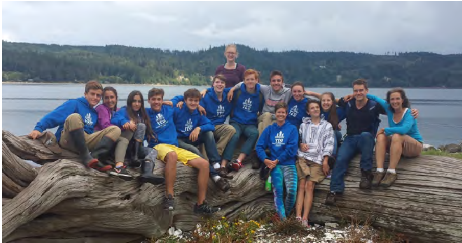
YES! Summer Science Field Intensive 2016 - Dabob Bay