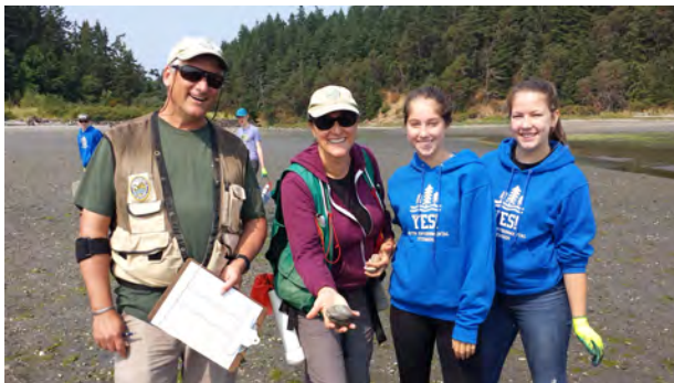
Mentors from WDFW, Summer Science Field Intensive 2017